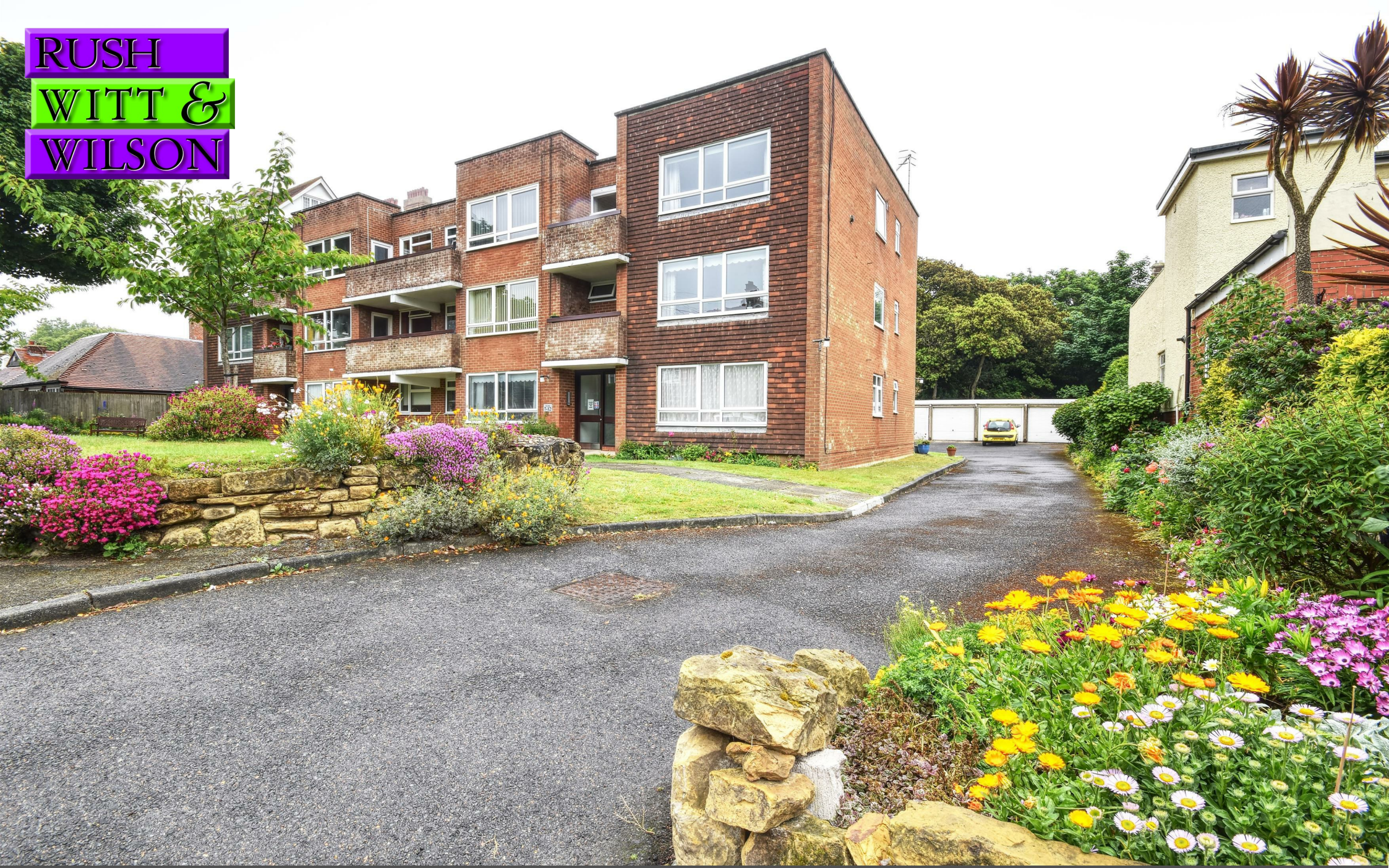
11 Boscobel Lodge Boscobel Road, St. Leonards-On-Sea, East Sussex TN38 0YL £269,000